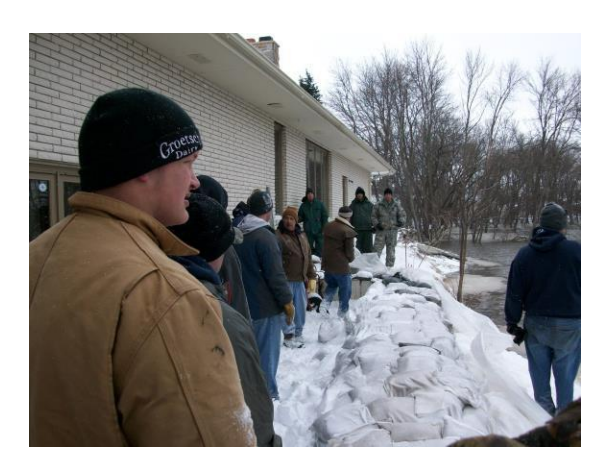
Great River Energy Tour